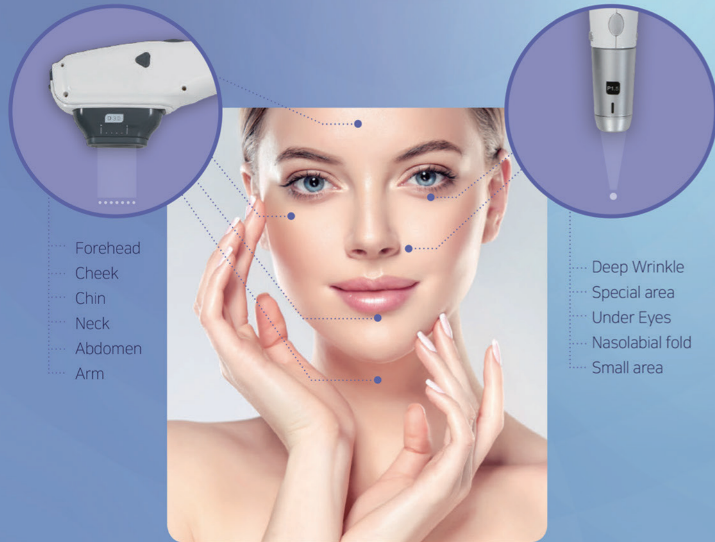
Use freely from small to large area.